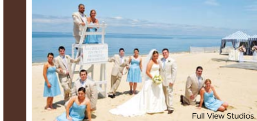
Full View Studios