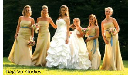
Déjà Vu Studios